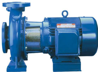
Sales, Repair and Maintenance for Submersible or Centrifugal Pumps and Motors