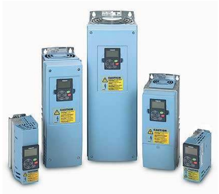
Sales, Repair and Maintenance for Reliable Brands of Waste Water Motors and Drives

“In These Hard Times, You Need Someone You Can Count On.”