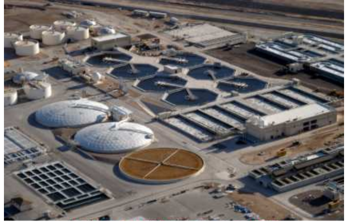
24/7 Emergency Industrial Automation, Electronic and Motor Troubleshooting