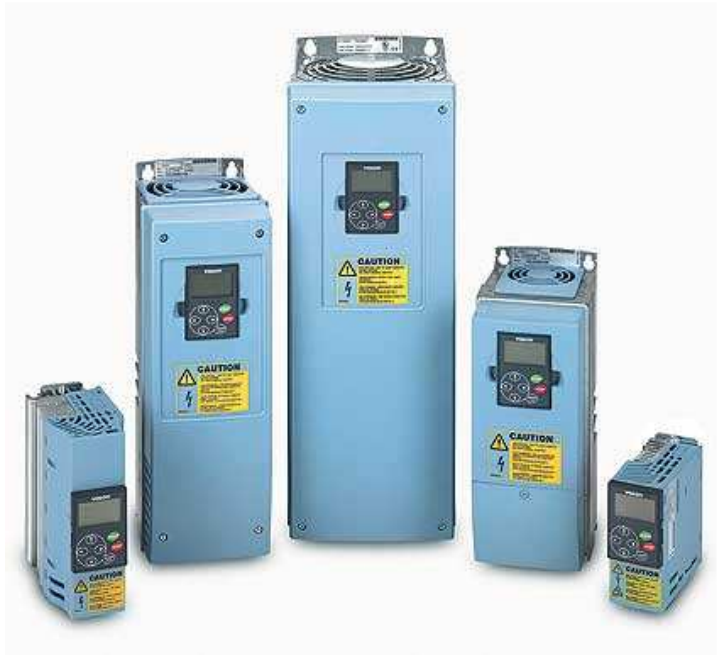
Reliable Brands of Water Works Motor Drive Sales, Repair and Maintenance

“In These Hard Times, You Need Someone You Can Count On.”