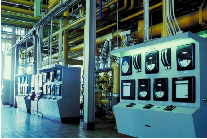
Outdated Systems? We Engineer and Retrofit Motion, PLC and Drive Systems