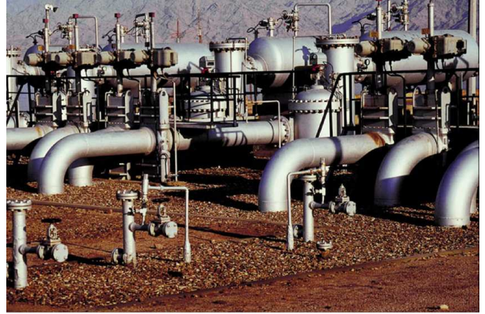
24/7 Emergency Industrial Automation, Electronic and Motor Troubleshooting