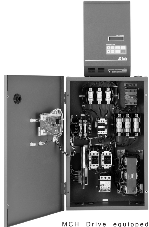
MCH Drive equipped with Bypass, Line Reactor, Disconnect, and Bypass Fuses